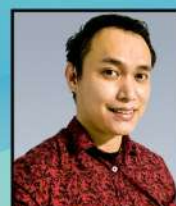
Region 6 Ibi Gibreson